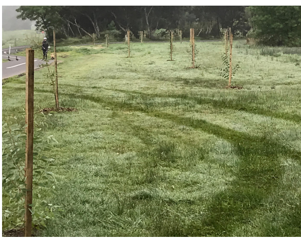
Baywater Rotary 100th Anniversary planting