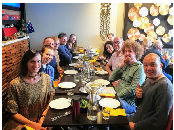
FFDC Committee for 2019/20