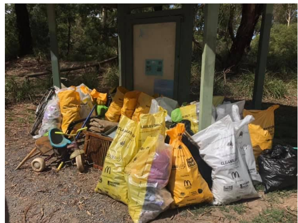
Collection from Clean Up Australia Day