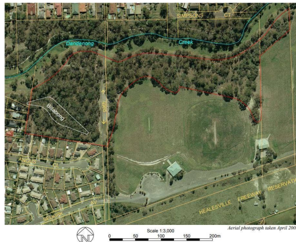
Aerial image of Manson's Reserve billabong location