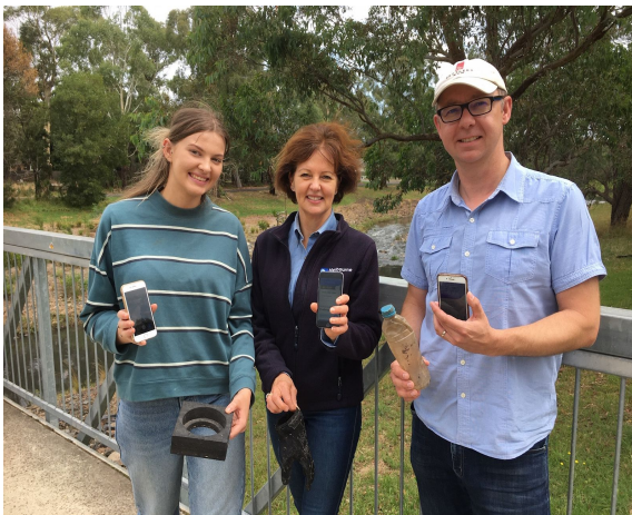
Using the Litterati App

More information to come shortly, and we'll be needing help from the Heathmont community to deliver this project!