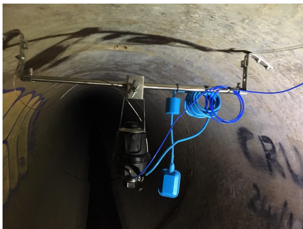
Pollution monitoring equipment installed in stormwater drains

All planned FFDC events for at least the next 3 months are postponed or cancelled. This includes our World Environment Day event planned for Saturday 6 June. We are planning to run our monthly committee meetings via video conference to comply with the current restrictions for social gatherings. Please stay safe during these challenging times and we look forward to continuing our great work with you when this is behind us.